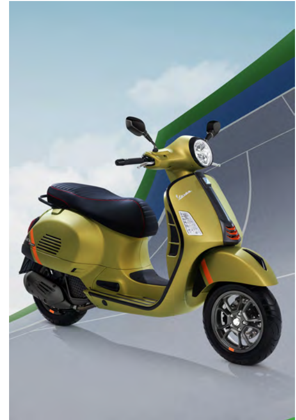
GTS SUPER SPORT